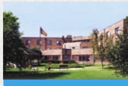
Carefree Living Burnsville

Services available include medication monitoring, assistance with personal cares, housekeeping, laundry and daily services. Memory care is available at select locations.